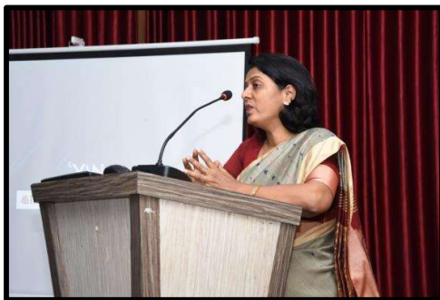
Feed back in valedictory function of ICITLE -2019