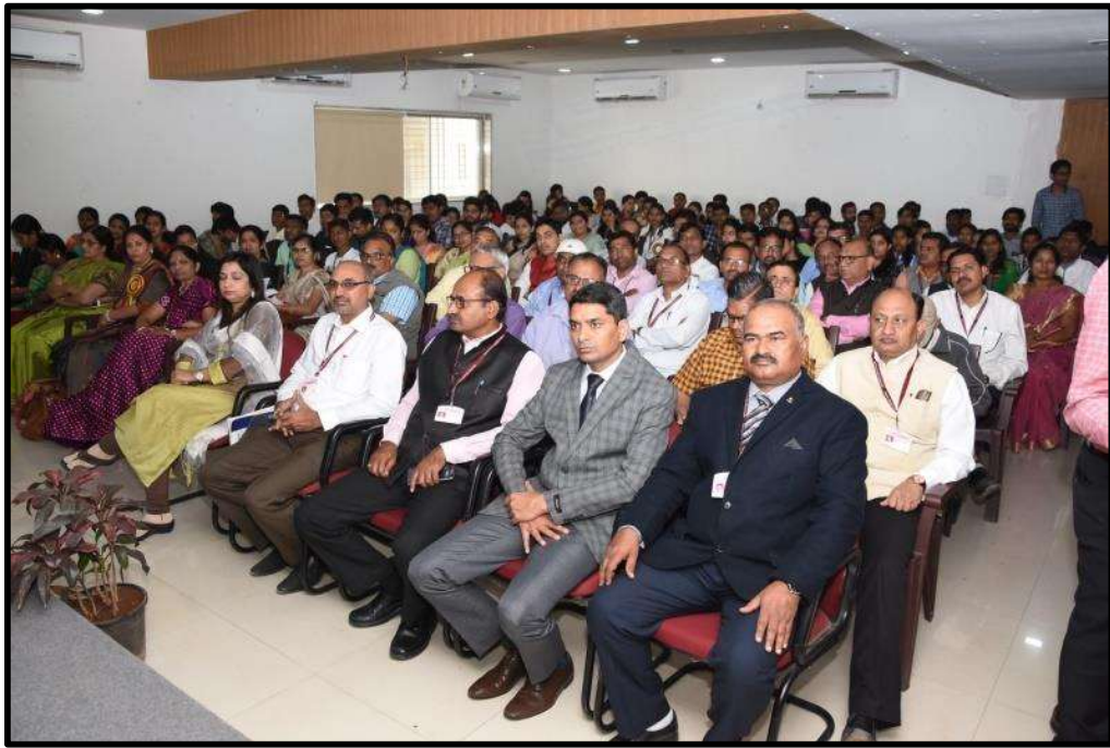
Delegates, participants and students