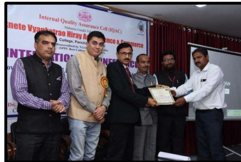
Certificate distribution in ICITLE -2019