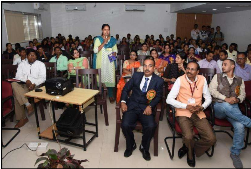
Delegates interaction in ICITLE – 2019